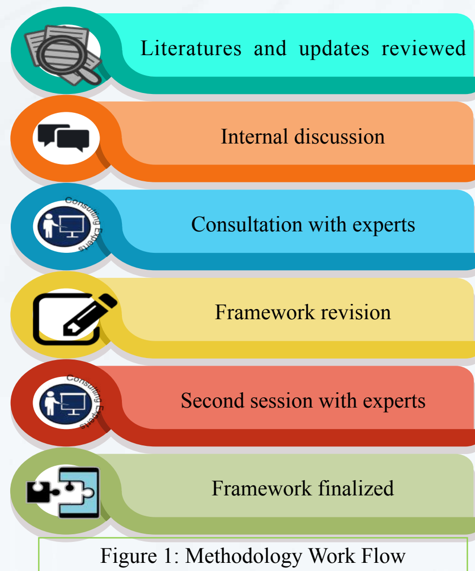
Figure 1: Methodology Work Flow

Within the respective outbreak phases (Figure 3), there were three main sub frameworks of activities (Figure 2) identified namely Patient under Investigation (PUI), Person under Surveillance (PUS) and concurrent relevant support activities. The activities continued and expanded or reorganised from phase 1 to 2 and 3.